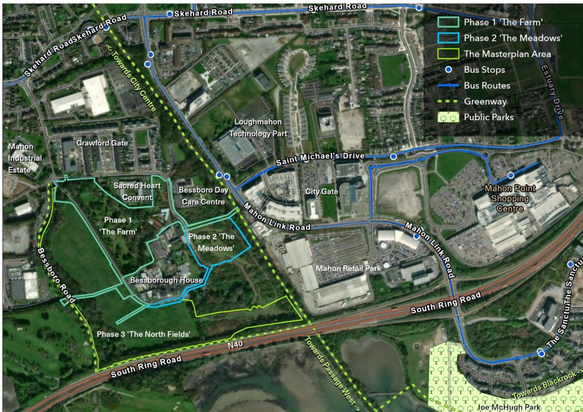
Figure 1.1 Site Location Map