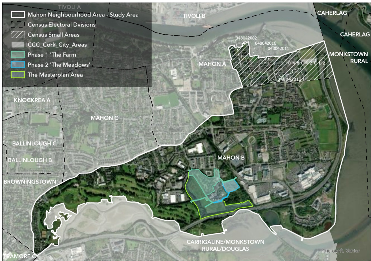
Figure 14.1 Immediate Study Area

by an inlet of Cork Harbour and the N40 to the south and east and by Skehard Road and Ringmahon Road to the north. However, the residential element of the area extends slightly northwards into the smaller, predominantly residential ED of Mahon A where the Mahon and Blackrock neighbourhoods meet. Therefore, five Census Small Areas (SAs), which are the lowest level of geography for the compilation of census statistics generally comprising between 80 and 120 dwellings, were included to the north. We note that the resulting study area corresponds to the Mahon Neighbourhood Area as defined in the Cork City Neighbourhood Profile prepared by AIRO to support the Cork City Development Plan 2022 - 2028. The boundaries of these areas are illustrated in Figure 14.1 as shown