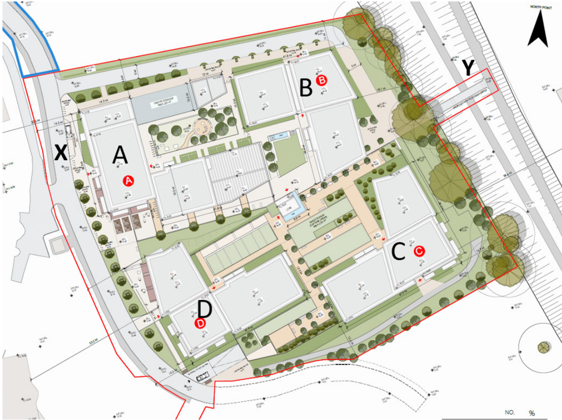
Figure 3.5 Phase 2 ‘The Meadows’ Alternative B

A further Section 247 meeting was held with the City Council to present the revised approach to the Masterplan. The revised layout ‘Alternative B’ was then submitted as part of the pre-planning consultation with An Bord Pleanála – ‘Tripartite Submission’.