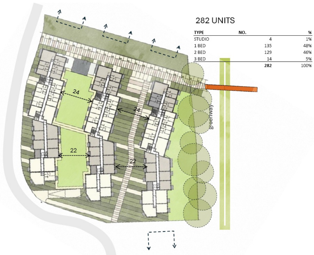
Figure 2.2 Proposed – Phase 2 ‘The Meadows’ Development