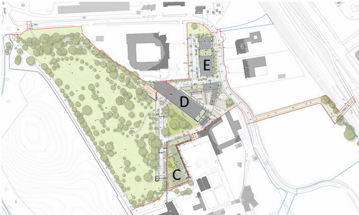
Figure 3.3 Phase 1 ‘The Farm’ Alternative C