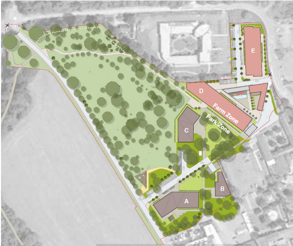
Figure 3.2 Phase 1 ‘The Farm’ Alternative B